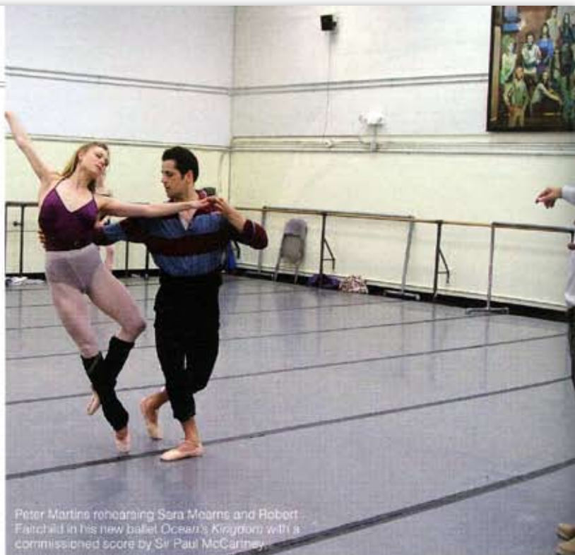
Peter Martins rehearsing Sara Mearns and Robert Fairchild in his new ballet Ocean's Kingdom with a commissioned score by Sir Paul McCartney.