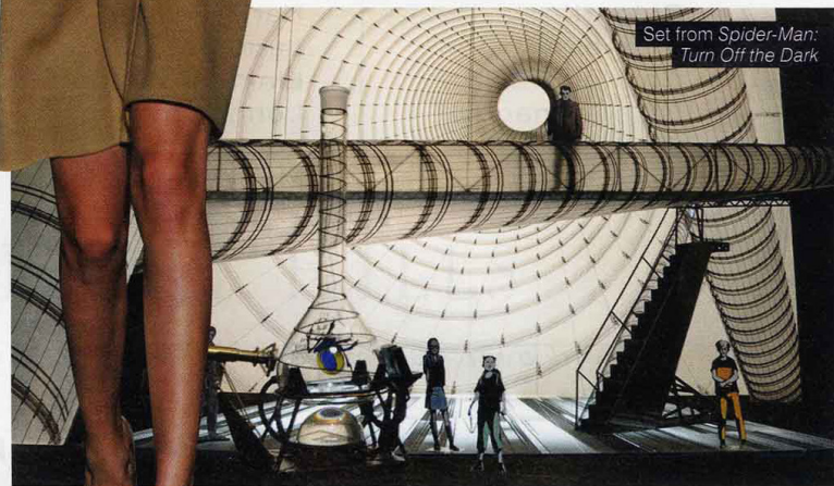
Set from Spider-Man: Turn Off the Dark