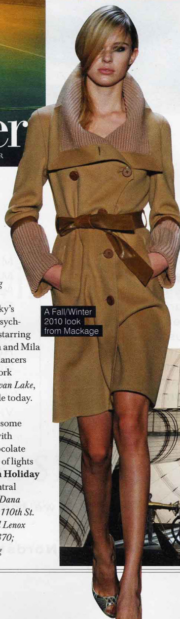
A Fall/Winter 2010 look from Mackage